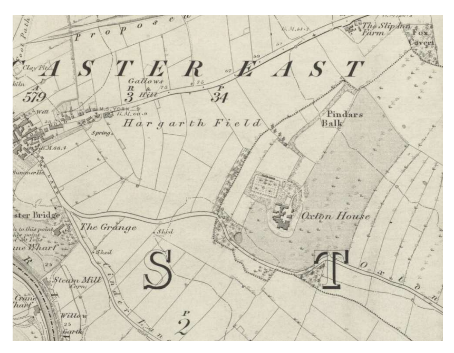
Figure 3 – Oxton House park and gardens. 1<sup>st</sup> edition 6" OS map, surveyed 1846 to 1847, published 1849.