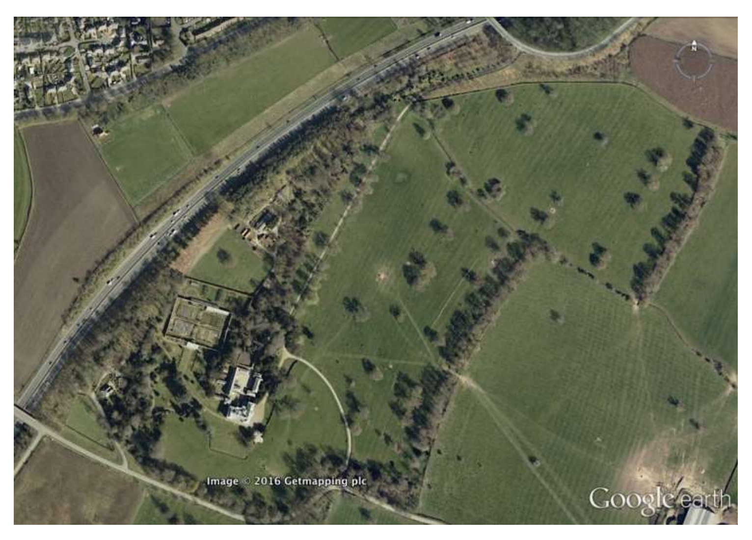
Figure 1 – Oxton Hall estate. Google 31/12/2005, image © 2016 Getmapping plc