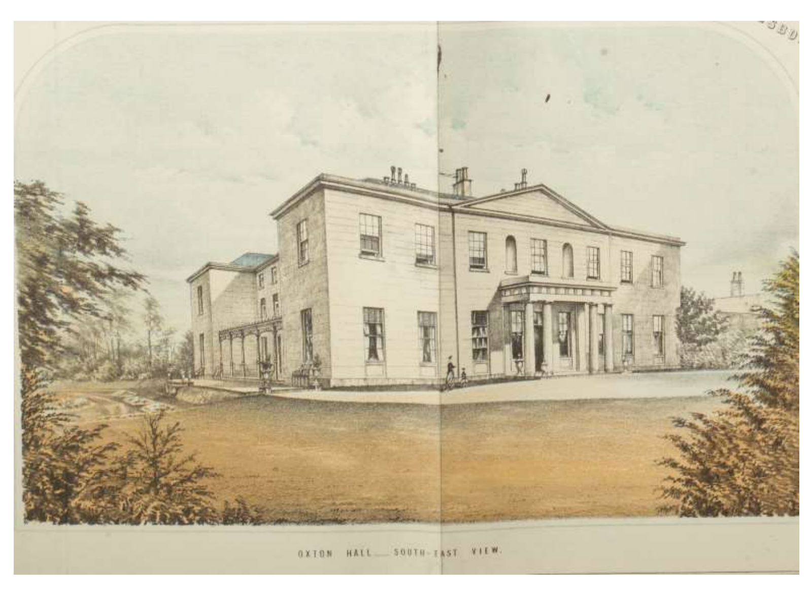
Figure 5 – Drawing of Hall and garden from 1872 sale plan (LULSC YAS MD290/6/3).