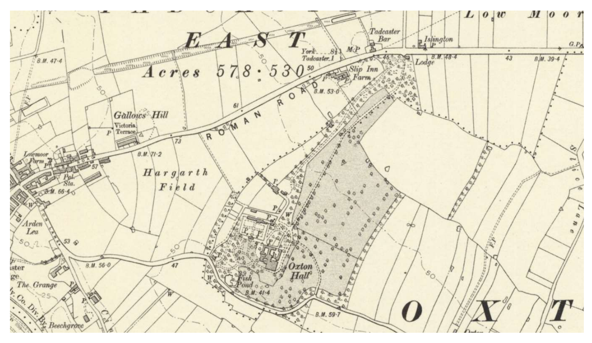
Figure 6 – Oxton Hall estate. 6" Ordnance Survey map surveyed 1906 and published 1909. Reproduced by permission of the National Library of Scotland.