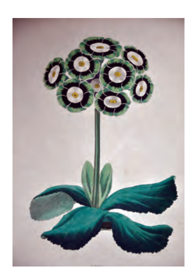
'Achilles' - a green-edged auricula raised in the 1830s and priced at one guinea.

Floriculture is the art of growing a flower purely for its beauty alone rather than its value, hence the title of my lecture - 'Beauty for Beauty's Sake'. This practice first appeared during the 17th century; before then it was mostly herbalists, druggists and monks who concerned themselves with plants. In those days the word florist did not mean a person who sold cut flowers as it does today, but someone who grew exquisite flowers for exhibition. At that time there were just eight which fell into this category: auricula, polyanthus, hyacinth, anemone, ranunculus, tulip, pink and