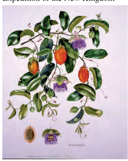
Passiflora laurifolia by Geraldine King Tam, 1995

Mutis was keen to promote natural history and in 1781 became Director of the Royal Botanical Expedition of the New Kingdom