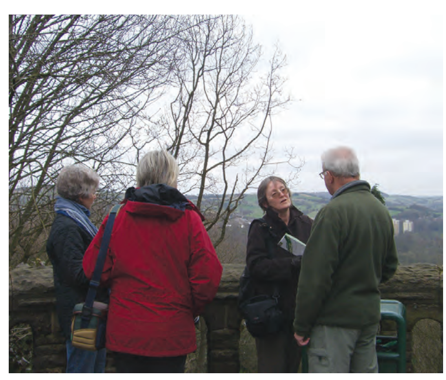
YGT members discuss the views and planting with the Friends of Beaumont Park

The Friends wanted advice on some planting in shady woodland areas. Ferns such as the Male Fern Dryopteris filix-mas, Lady Fern Athyrium filix-femina and Hartstongue Asplenium scolopendrium were all mentioned as well as native wildflowers such as Woodruff Galium odoratum, Wood Anemone Anemone nemorosa, Sanicle Sanicula europaea and Wood-sorrel Oxalis acetosella.