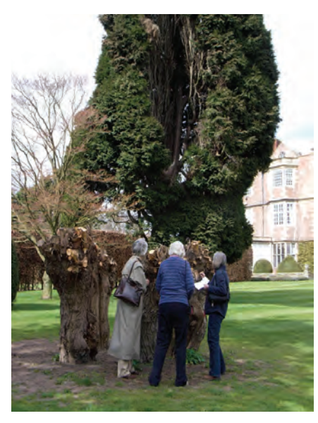
YGT members inspecting the tree management.

Unfortunately by 2005 the surviving part of Princess Mary's gardens had fallen into decay, while part of the grounds, including her rose garden and the walled garden had earlier been sold off. However, photographs and watercolours survive to serve as an inspiration for the new planting scheme undertaken by Clare Oglesby since 2006 in the Gertrude Jekyll style. A new rose garden has been planted with old varieties interspersed with lavenders. The long herbaceous border, having been completely cleared of perennial weeds, follows