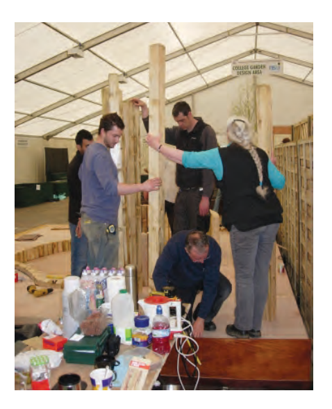
Leeds City College garden at Great Yorkshire Show - beginning

I have been compiling the maintenance schedule for the many