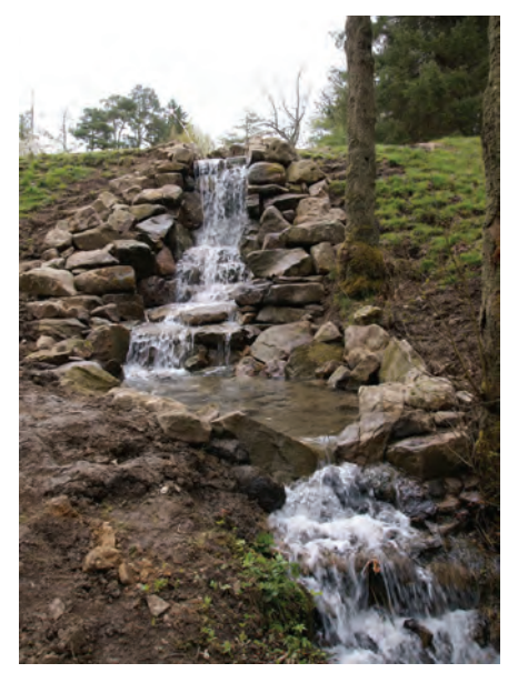
The water falls into a new pool before rejoining Tarn Ghyll Beck

I wish to thank everyone who has helped make this project possible, especially the Editor of the Dalesman for including a feature on our project in the April issue when already starting to put the finishing touches to the proofs, and of course the YGT for awarding their maximum grant from the Small Grants Scheme.