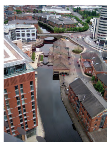
Fig. 1. The Leeds-Liverpool canal basin

and going at the railway station. (Fig. 2) While their design speaks of the Victorian confidence that Yorkshire could emulate the textile prowess and architectural culture of Renaissance Italy, the exhortation in turf – TRANSFORM – is resonant of the optimistic role of urban gardening within the city's regeneration programme.