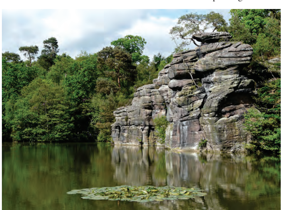
Plumpton Rocks

even for those who had seen them before, and we continued down and across the dam - with a detour for the intrepid to see the construction of the dam from below. A path then led through the woods around the edge of the lake, with exquisite views back to the rocks, into the gloomy chasms of the dramatic rock formations, past the boat-house and out into the 18th C plantings.