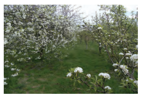
Pear and plum blossom in Lower Tees Valley

I can also report that the project to study the Traditional Orchards of the Lower Tees Valley, which the YGT was keen to see get underway, is producing some very interesting results. An encouraging number of