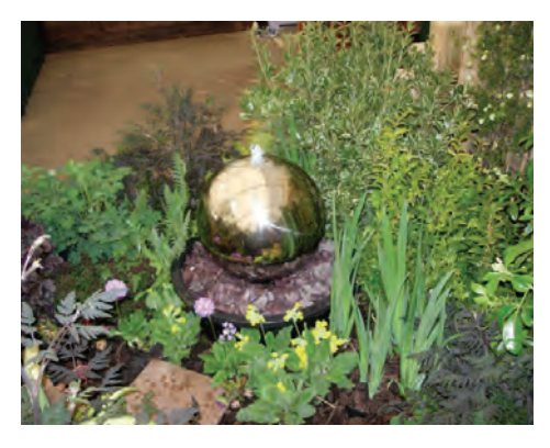
Leeds City College garden at Great Yorkshire Show - finished!

acres of the horticulture department and have taken part in an evening of 'Balsam Bashing' (to try to reduce the invasion of this across the site). All of which make me aware that horticulture is both a pleasure and hard labour. I applaud all gardeners who tirelessly tend to routine tasks and meet all the challenges of pests and weather and random interferences (including open-days and garden visits) that arise.