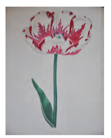
Early 19th C flamed tulip 'Rose Camuse de Craiz' priced at six guineas a bulb

carnation; all were grown at York but the auricula, tulip and carnation were the most popular. The result of future botanical exploration ensured that others would follow - pelargonium, dahlia and most importantly the chrysanthemum.