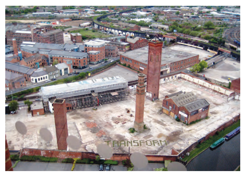
Fig. 2. The Three Chimneys and the turf exhortation: TRANSFORM