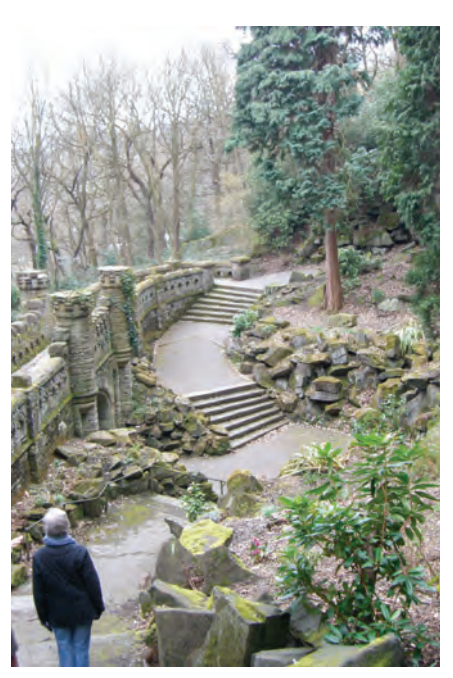
An area identified for the fernery

In discussing the work and future planting at Beaumont Park, some elements came to light that YGT members, who belong to a Friends or Community Group, may wish to bear in mind when developing their local area: