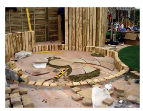
Leeds City College garden at Great Yorkshire Show - mid-build