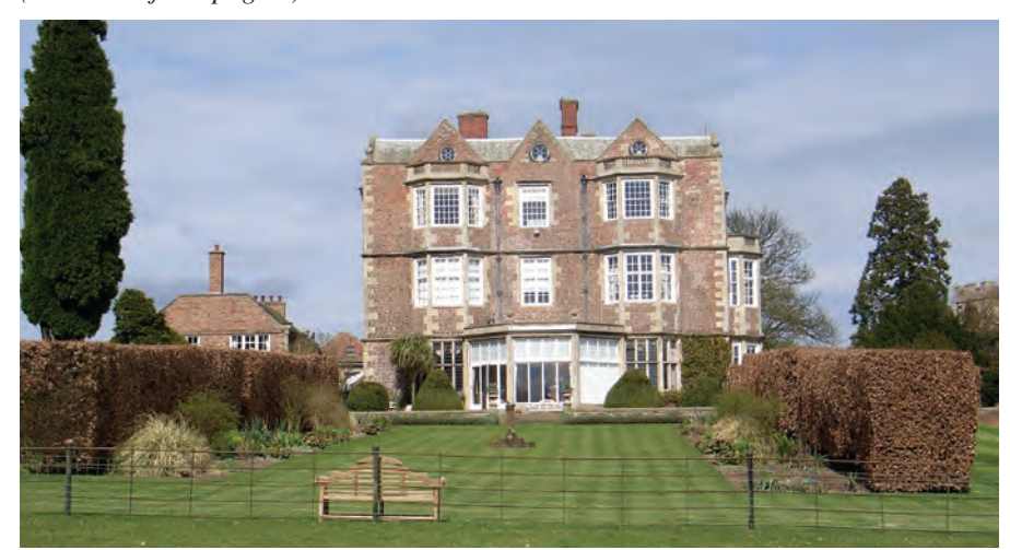
Long herbaceous border to South-West of Hall

a Jekyll-type scheme of colour arrangement progressing from pale tones to strong shades in the centre then reverting to pale yellow and white. Amongst trees of interest in the grounds are Robinia pseudo acacia (already a substantial tree in photographs from the 1920s), a large copper beech possibly marking the burial site of Byerley Turk, a giant Wellingtonia and a Wollemi Pine, which was planted by Mark Oglesby in 2009 to celebrate