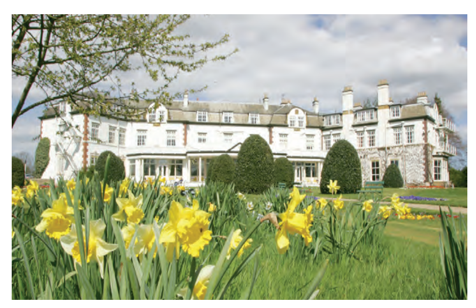
Ripon Spa Hotel

The 2010 AGM of the Yorkshire Gardens Trust took place on 20th March at Ripon Spa Hotel.