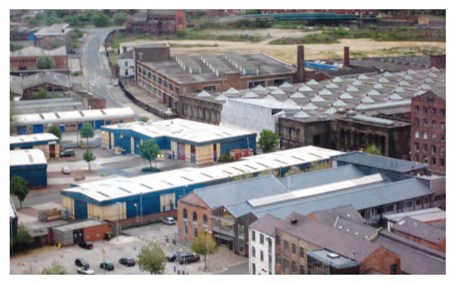
Fig. 3. Marshall's Mill and roof, with façade under conservation