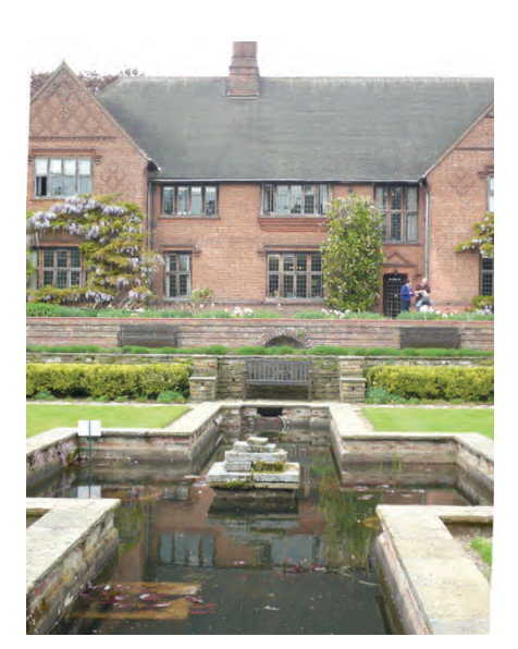
Garden Front showing central canal