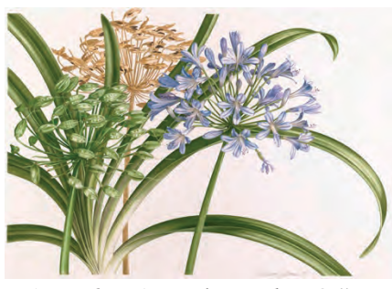
Agapanthus africanus by Pandora Sellars.

Experience exquisite illustrations highlighting the beauty and diversity of flowering bulbs around the world, and discover how Kew's scientists, conservationists and horticulturists continue to combine forces to understand and conserve the remarkable diversity of bulbs and other plants. Displayed in the Link Gallery is Bulbmania - Hidden Treasures, featuring contemporary paintings from the Shirley Sherwood Collection. Also on show in the gallery is Portraits of a Garden - a selection of illustrations from the Brooklyn Botanic Garden Florilegium.