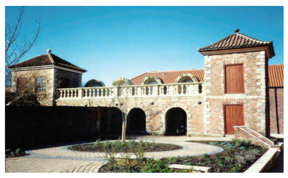
18thC gazebo