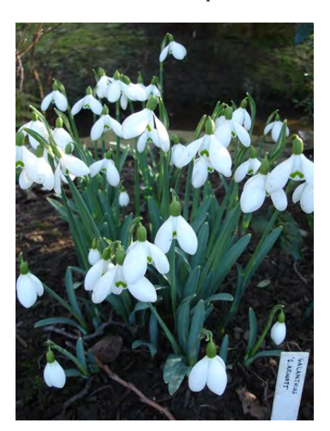
Snowdrop 'Arnott', a good beginners' variety

We now know this to be inaccurate because other locations were known but snowdrops were obviously not widespread at that time. In the nineteenth century they became associated with Candlemas, the Feast of Purification on 2<sup>nd</sup> February, and for this reason became widespread around