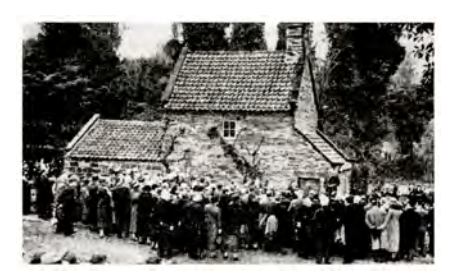
Press photo of the opening ceremony, 1934.

also the added advantage of echoing the original rural English setting of the cottage.