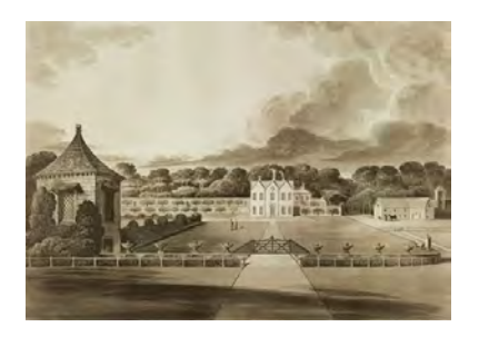
Figure 1 - Farnley, 1781, Artist R.F., Gott Collection.

By 1771, Francis II, the third son of Francis I, had inherited the estate and a 1781 illustration (Figure 1) shows the high walls of the enclosed gardens to the south of the Hall had been removed, but the pavilion shown on the Buck sketch was retained.