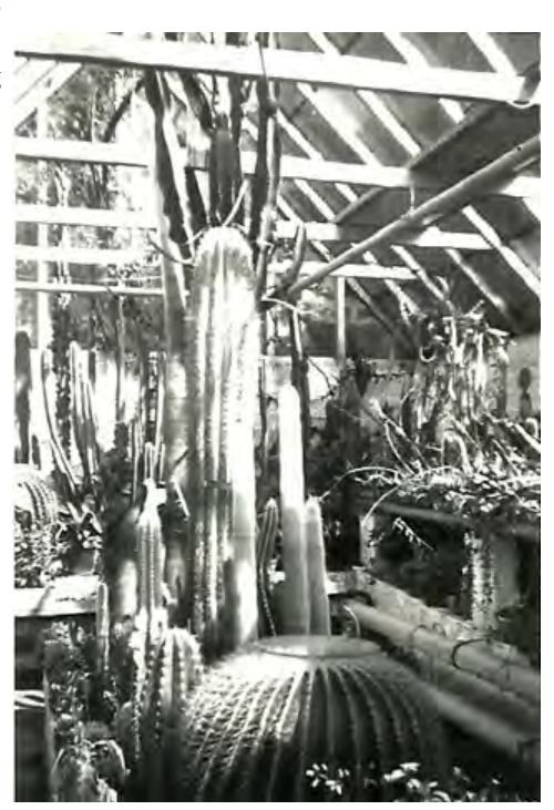
Cacti at Normandale Nurseries (photo: Ray Blyth c.1958).

On the night when the night flowering Cereus was to flower, Alice Ethel,