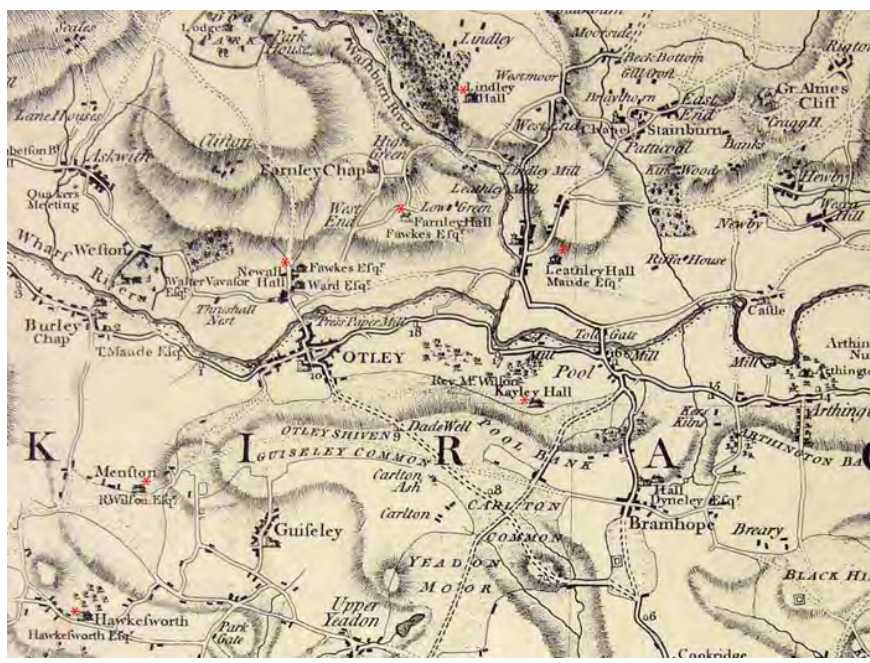
Figure 2 - Annotated Thomas Jefferys Map, 1775 * Halls in Fawkes ownership by the end of the C18.