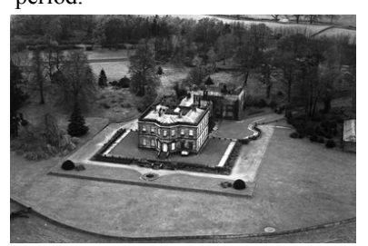
Figure 8 - Aerial view of Farnley Hall c. 1934-7.

photograph from the Woods Archive, Bradford Industrial Museum of c . 1934-7 (Figure 8) appears to show that the original terraces and balustrading were still in situ in this period.