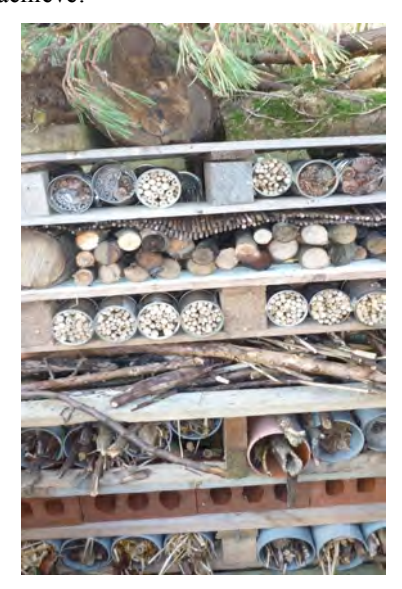
The insect hotel at Old Town Primary School.

The last YGT Newsletter saw Old Town Primary in Hebden Bridge being granted a £200 award to develop their school garden. So far, the school has used the money towards helping the youngest children construct an impressive insect hotel (see photos), as well as planting Spring bulbs, making bird-feeders, constructing a wildlife pond and sowing nectar-rich flower seeds. They have further plans to grow and sell cut flowers at school and construct a herb tower. It is wonderful to see how much one award can achieve!