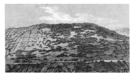
Figure 5 - General view of the same residence in the author's style by J.C. Loudon.