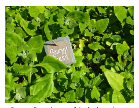
Scurvy Grass in one of the herb gardens.

patch of 'Scurvy Grass' (Cochlearia officinalis) or 'spoonwort' and it is stated that whilst this plant was not found in the average English cottage garden, it had been planted here due to its interesting link to Cook. Scurvy was a disease caused by a lack of vitamin C and was common among