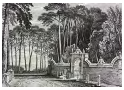
Figure 6 - Gateway to the Flower Garden at Farnley removed from Menston Hall, formerly the seat of Col. Charles Fairfax, AD 1814.

What we do know is that there was then a Flower Garden, as two illustrations, dated 1814, in T.D. Whitaker's book, Loidis and Elmete , show its ornamental Gateway and the Flower Garden Porch (removed from Newhall). It must surely have been north-east of the Hall where the 1851 OS map appears to indicate a large walled garden, as according to Whitaker "through the Porch is the passage from the Garden into the Mansion itself".