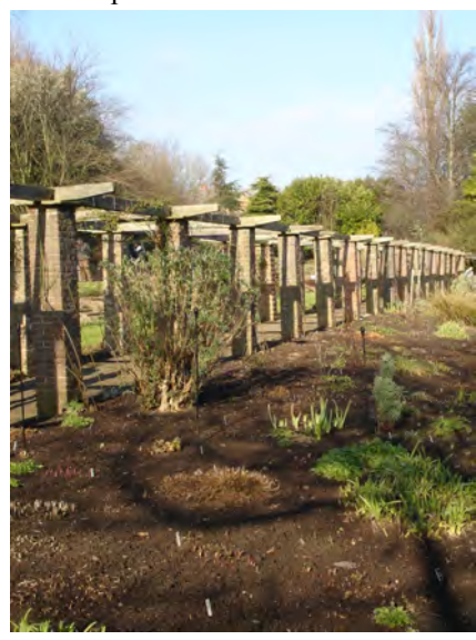
The pergola, comprising 48 pillars.