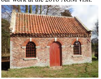
One of the horse shelters at Scampston. (Photograph: Margaret Nieke).

At Scampston we have been funding a range of restoration projects. These aim to complement the HLF Conservatory project and enhance the site for its forthcoming starring role in next year's Capability Brown 300 celebrations. Intriguing research work has discovered a previously unrecognised Capability Brown period landscape plan for the park whilst geophysical work has suggested that the earlier Bridgeman landscape design really was laid out on the ground. Of particular interest, however, are a number of early 18th C horse shelters which still survive and are indicative of an important racing stud. Members will be able to see all of our work at the 2016 AGM visit.