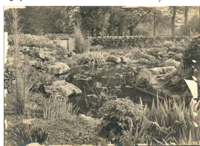
Farrer's pool at his nursery in Clapham, North Yorkshire.