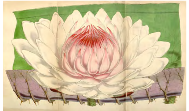
Figure 1 – Drawing of 'Victoria Regia' from Curtis's Botanical Magazine Volume 3, 1847