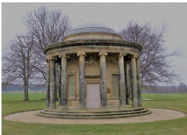
Bramham Ionic temple, probably by James Paine, mid C18th, built at the intersection of 6 avenues leading to other features in the designed landscape