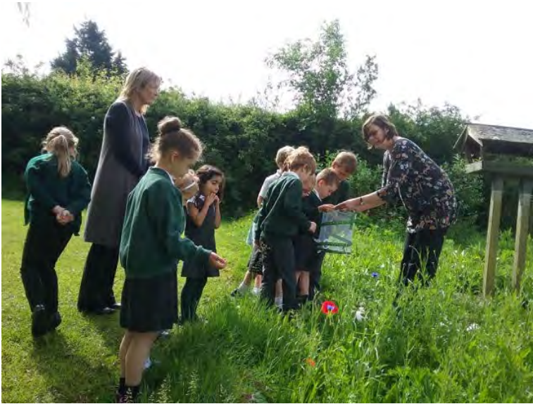
Pupils from Ingleby Greenhow C of E Primary School releasing their butterflies from the YGT hatching kit.