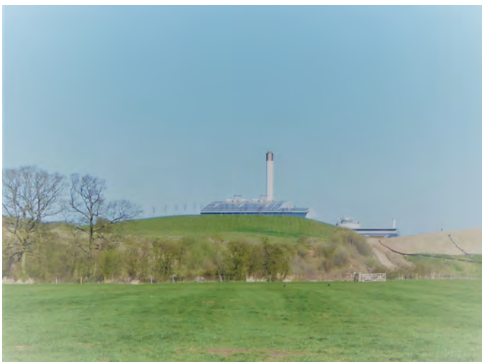
View to the incinerator and landfill from northern area of Allerton Park.

myself had a most interesting day and I was very struck by the quality and topography of the park and the associated lakes and eye-catchers, although dismayed to see the impact of the landfill site and incinerator.