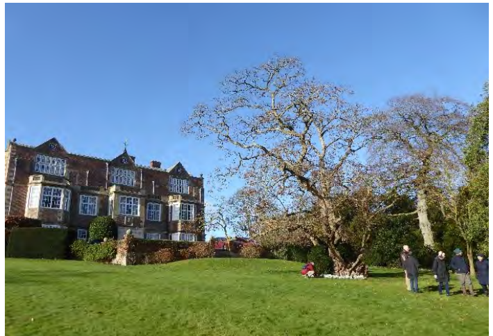
The South Front.