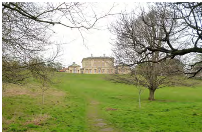
View to the south east front of Cusworth Hall from near Middle Fish Pond

We much appreciate being consulted for advice prior to any works at our historic parks and gardens, so it was a pleasure for Jane Furse and I to visit Cusworth Hall and Park in Doncaster MBC at the invitation of Pete Lamb, Principal Planner (Design and Conservation) to discuss new path proposals with