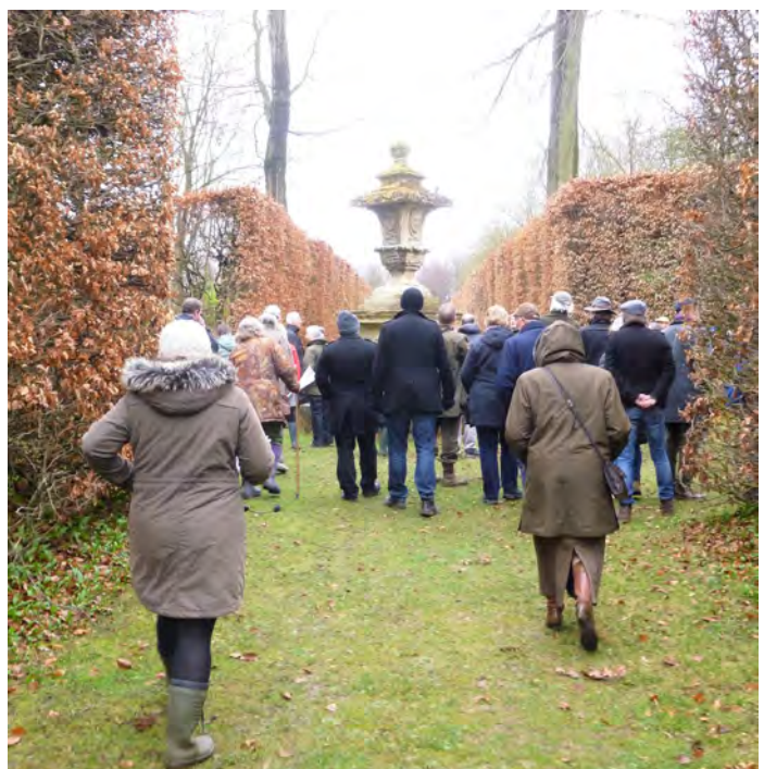
Bramham Park - approaching the early C18th Four Faces at the intersection of avenues

Environmental stewardship schemes often extend beyond the historic park and garden because the