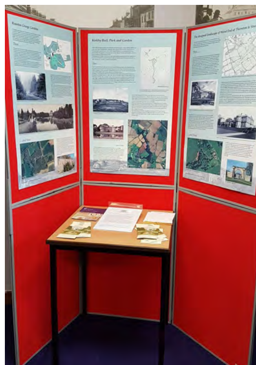
Figure 5 – Display stands in-situ at Northallerton Library.

The walled garden, also shown on 19th century OS maps, shows planting, paths and greenhouses. The entrance, from the north, appears to be via a greenhouse. There are details of the garden space to the north of the walled garden and to the south of the south front of the 18th century façade. This shows indications of planted areas with pathways