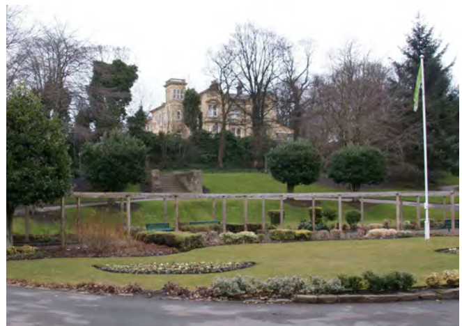
The Mount from Peel Park.

In the last Newsletter I wrote about two major planning applications involving large 4/5 storey apartment blocks; one on the boundary of Sheffield General Cemetery and the other extending The Mount, a Victorian villa, on the boundary of Peel Park, Bradford.