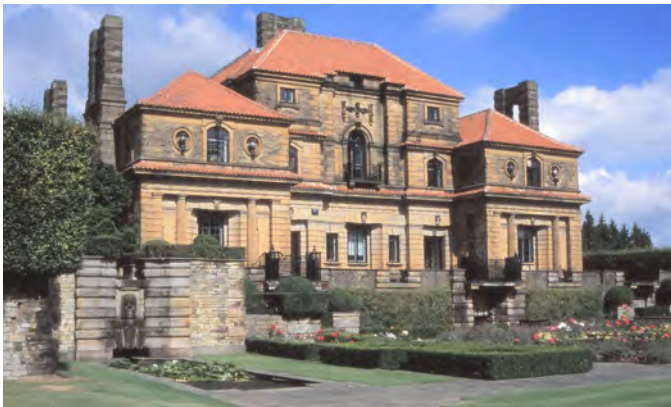
Heathcote, south front. The apartment block would be visible on the right, above the hedge.

As I write in May we have just responded to another demolition and large apartment block proposal. This time in Ilkley, where the proposal is to demolish Limegarth, 27 Kings Road, in the Ilkley Conservation Area and immediately to the east of one of Sir Edwin Lutyens' finest house and garden designs, Grade I listed Heathcote, its several Grade I and II* listed features and its garden registered Grade II. It is one of only two Lutyens designs in Yorkshire.