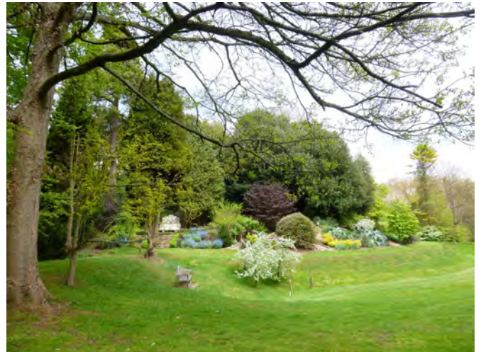
Aldby Park castle mound shrubbery from west

Karl Barker, the Yorkshire chainsaw carver, turned out to be a charming and unexpected feature of the garden, and several more were spotted as we walked around.