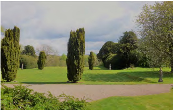
Aldby Park terraced lawns to east

The present grand garden with its terraces and walks dates from the mid-eighteenth century, following on, no doubt, from the building of the new house. The terraced lawns lead down to the steep bank to the Derwent below and create a formal setting to the garden side of the house. A surviving bill of 1746 shows that Lord Burlington's gardener Knowlton was responsible for the layout – "levelling, making and forming" – as well as planting, and uniting the earlier Castle Mound in the scheme. The final documented chapter in the garden's history was in the 1950s when Jim Russell advised on planning after the demolition of the wings. Peter brought copies of the project, although it is uncertain how much was in fact executed. Russell's papers are preserved in the Borthwick Institute.