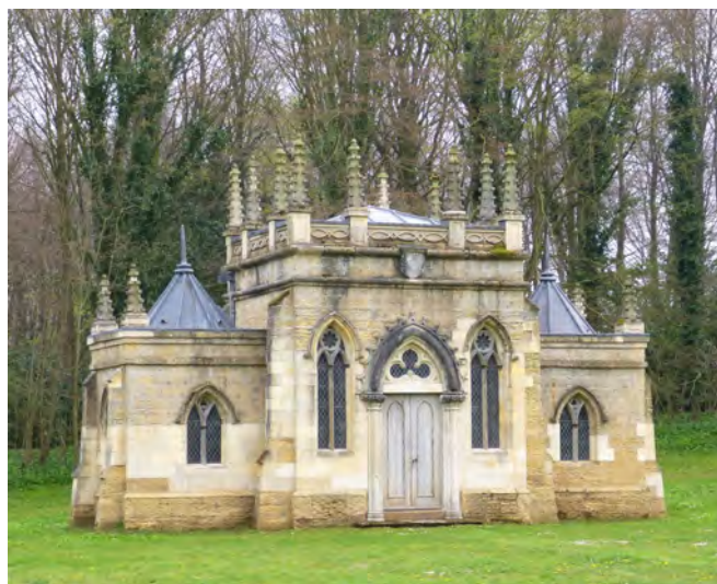
Bramham 'Museum', a Gothic summerhouse with a date stone of 1845; used as a changing room for former tennis court in front in C20th