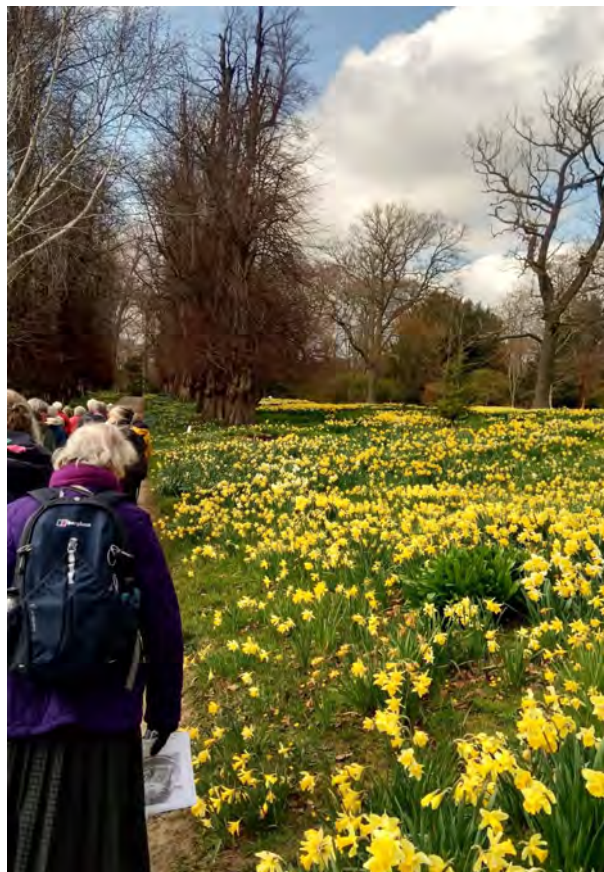
The daffodil meadow

The stream leads to an attractive Reflection Pond. This is something of a work in progress (aren't all gardens, always?). The aim is to use as far as possible only a palette of variants of green, rather than introducing anything showy. An interesting 'take' on Alexander Pope's observation that "all gardening is landscape-painting".