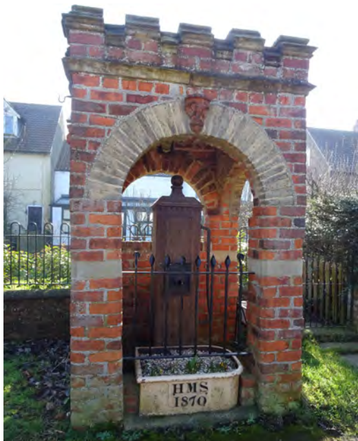
Figure 2 – Water Fountain at Myton.

embarked on an extensive programme of improvements to the estate. The Home Farm was rebuilt as a model farm. Other projects in the village included a new lodge, cottages, a fresh water supply in the form of a water fountain (now Grade II listed) and water trough bearing his initials (Figure 2).