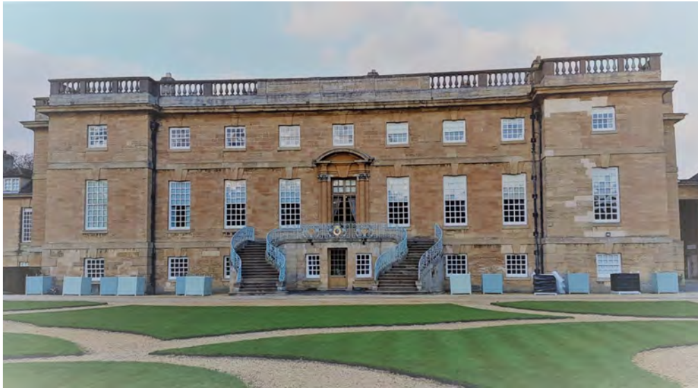
Bramham Park west elevation.