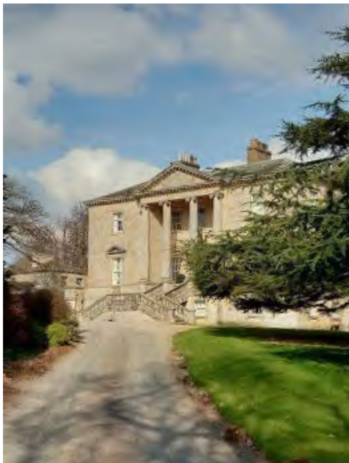
Constable Burton Hall