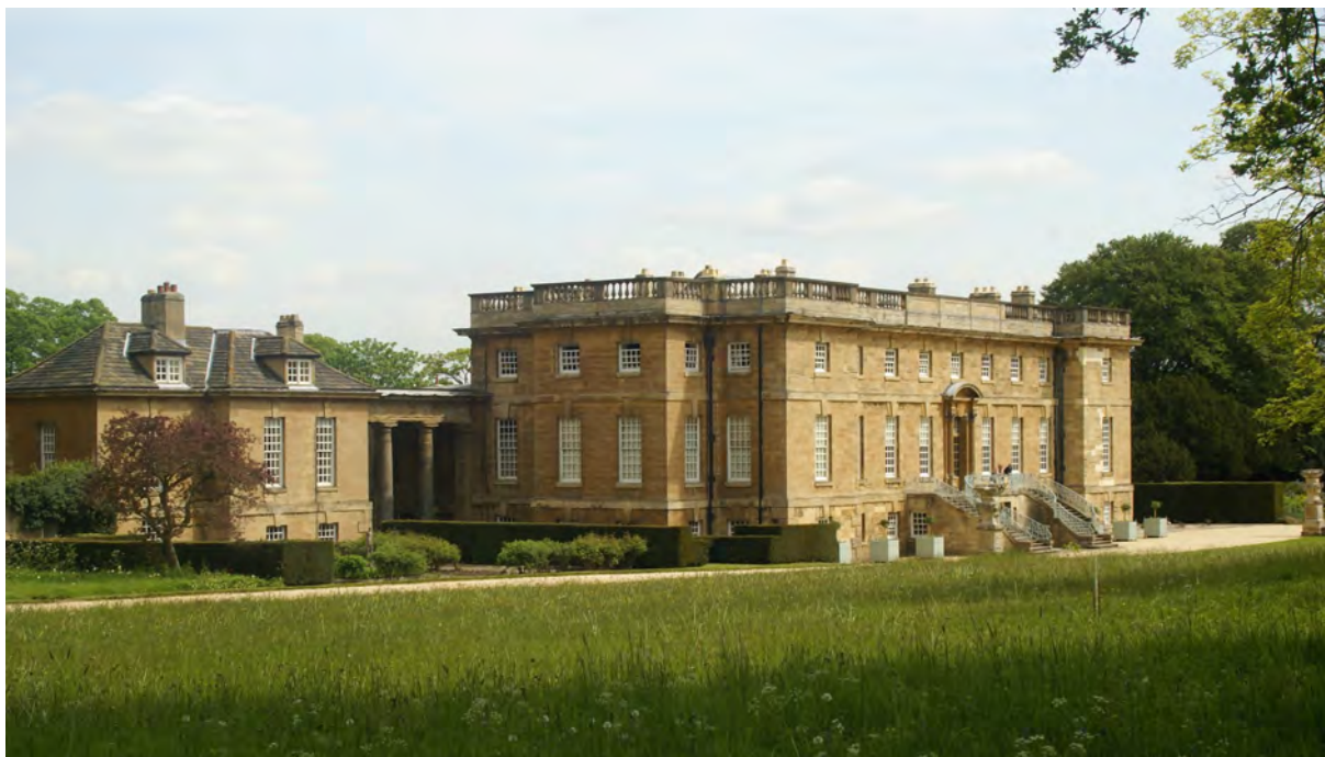
Bramham Park from the north west.