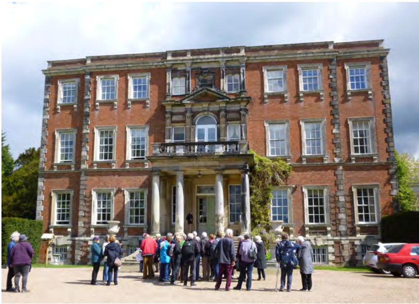
Aldby Park west front

We were fortunate to have a beautiful Spring day for our visit to Aldby Park. The rain held off and we saw the house and garden at their best. The handsome house of brick with stone dressings is approached on the west side, overlooking a wide green expanse which was formerly used by the local cricket club. The present avenue of poplars, replacing dead elms, will in due course be flanked by a recently planted double avenue of Sargentii cherry and lime trees.