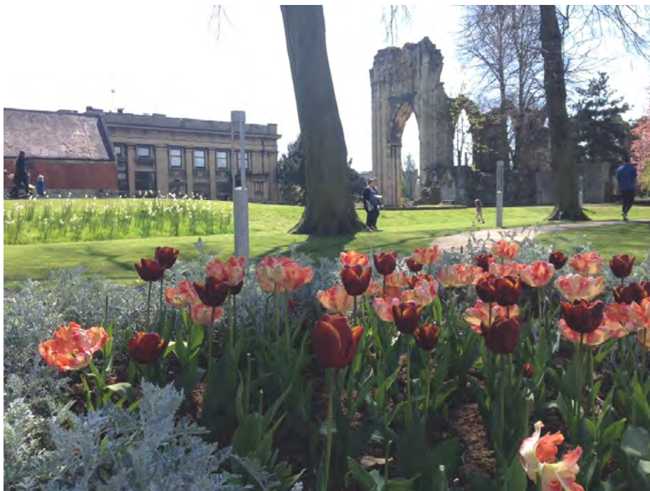
Spring in York Museum Gardens.