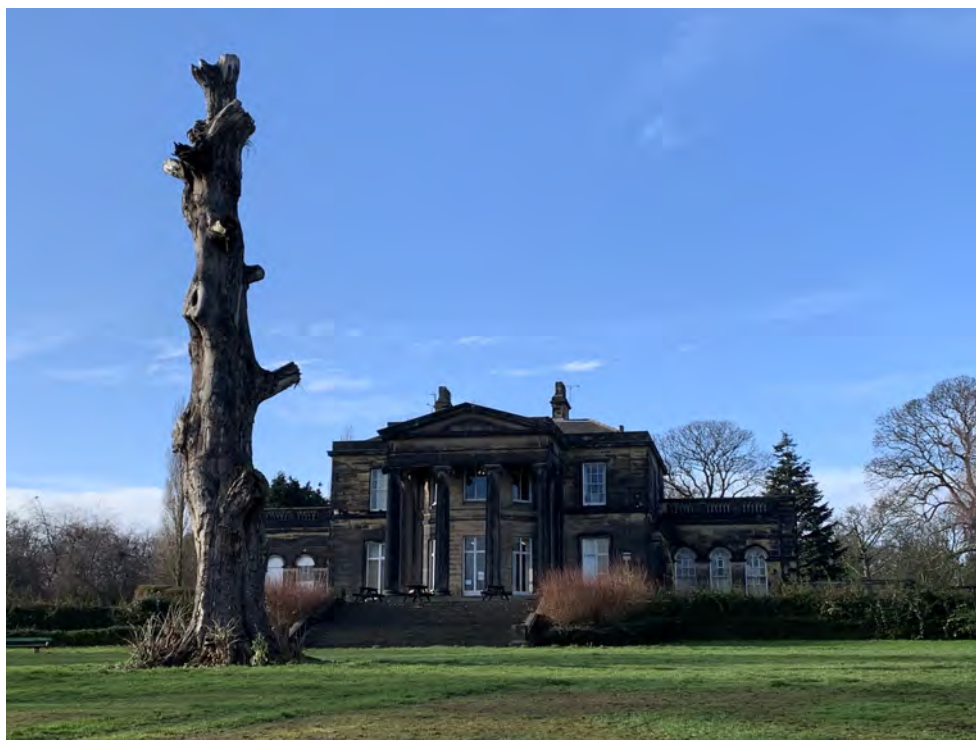
The front elevation of Gott's Park.