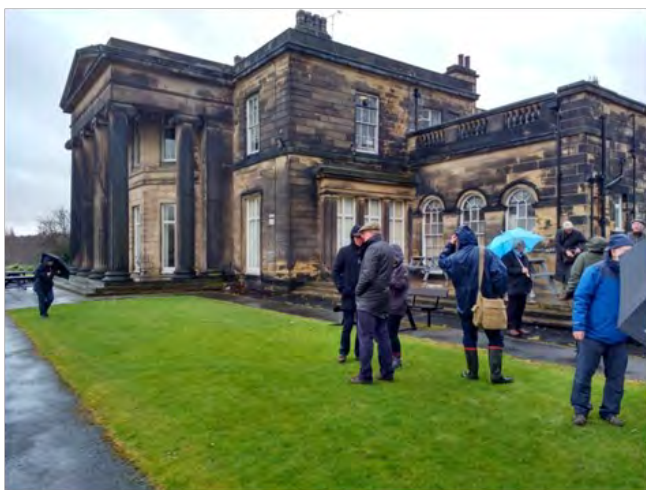
Preparing for a post prandial walk in Gott's Park.