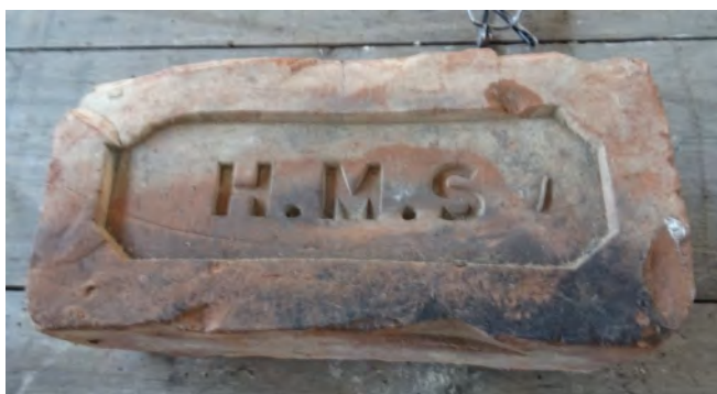
Figure 3 – Brick from Myton.