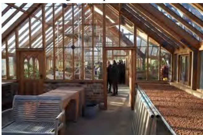
New glasshouse.

The glasshouse is split into three sections which allows for a range of temperatures.