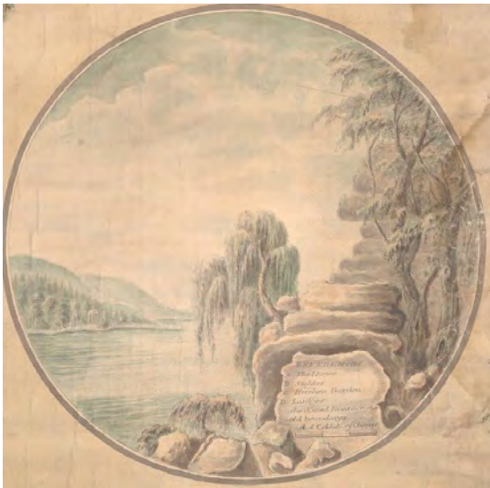
Cartouche of references from the Plan of Improvements for Campsall Hall by Thomas White 1796.