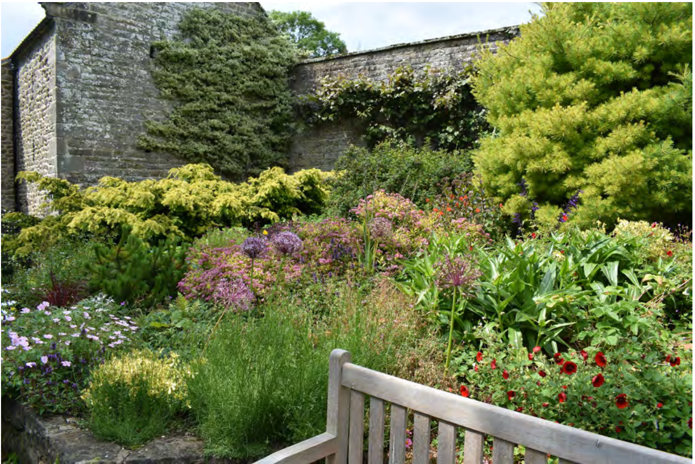
The south facing scree with the prized geum at the bottom right.