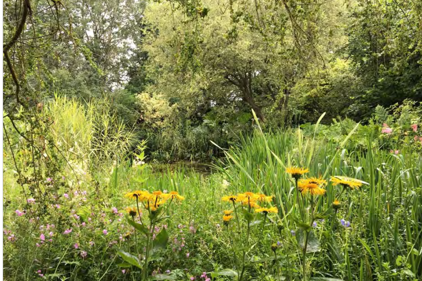
View to the wildlife pond.

In view of the coronavirus pandemic the majority of YGT Events for 2020 have had to be cancelled. It was therefore with anticipation that a number of members met at Vanessa Cook's Stillingfleet Lodge Garden and Nursery on 7 July. Within the restraints of social distancing, members were able to meet for the first time for many months and enjoy the delightful and peaceful surroundings.