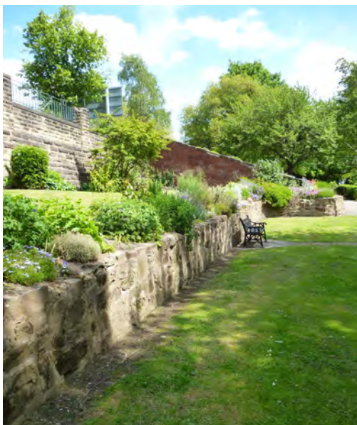
Friarwood Valley Gardens Sensory Border

York Gate Gardens joins two other very different post-war landscapes in Yorkshire that are registered in their own right. Friarwood Valley Gardens 2 in Pontefract (Grade II, first registered in 2001) is a post-war public park where the fundamental layout and design as described in the 1949 development proposals remains intact and visible. There was a friary on the site of the present gardens until the dissolution of the monasteries in the mid-16th century. After this the site was used as a cemetery until orchards were planted in the 18th century. The area was laid out as private gardens towards the end of the 19th century, but it was a 1930's road improvement scheme for Southgate which led to proposals for the land in the Friar Valley to be developed for pleasure ground purposes. The Parks and Allotments Committee approved the scheme in 1949 and work started in 1950. Principally designed by R.W. Grubb, the Borough of Pontefract Parks and Cemeteries Superintendent,