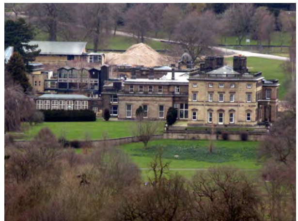
Bretton Hall 2018: elevation facing lake; marquee proposed for front lawn.

In July we responded to revised plans for the mansion house, associated buildings including Camellia house, car parking infrastructure and landscaping at Bretton Hall . As a result of our detailed response, particularly regarding our concerns with car parking, access and landscaping, we have been invited to a site visit in September with the planning and conservation officers of Wakefield Council and the developers.