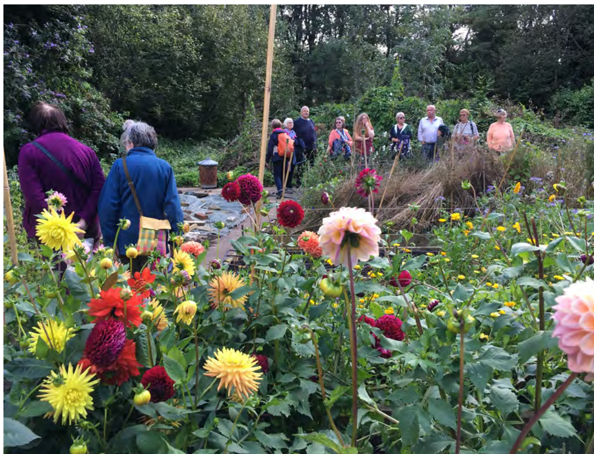
Blooms grown for cutting in Clem's Garden