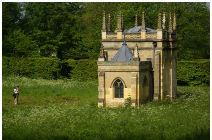
The Museum, Bramham Park.