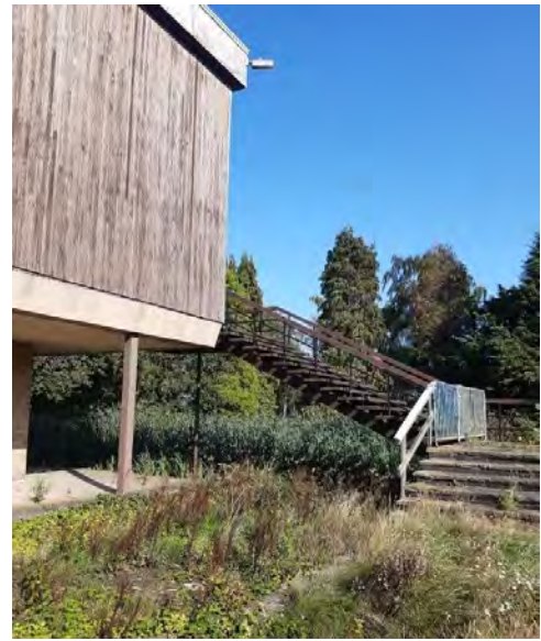
The gym building at Bretton Hall.

One important Yorkshire landscape which has not been included with the additions to the register is the landscape surrounding Eggborough Power Station near Goole, which was designed by Brenda Colvin. I am unsure whether this is an omission or whether it was not included because the power station has been decommissioned and the site is in