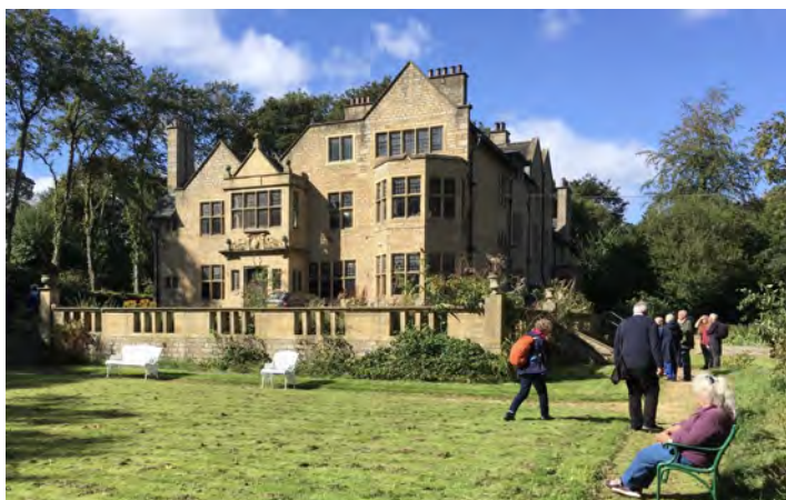
The house from the front lawn