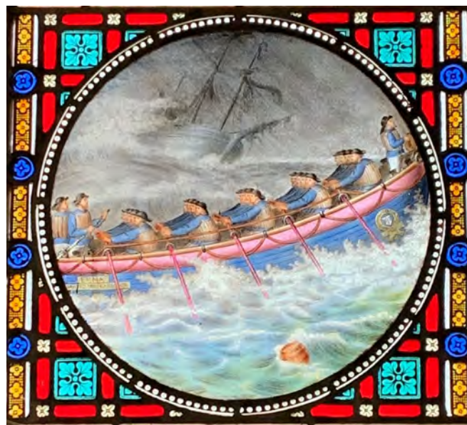
The memorial window in All Saints' Church.

Emma Dawson funded the Redcar lifeboat and lifeboat station in collaboration with the United Order of Free Gardeners and the boat operated independently of the RNLI: the full story can be discovered at the Zetland Lifeboat Museum in Redcar. The United Order of Free Gardeners originated in Scotland in the 17th century and the earliest members were gentlemen gardeners with land of their own. Within a century the Order had grown to include professional gardeners and provided training and a benevolent fund. The members were not freemasons, but were similarly organised in lodges, and held floral exhibitions and horticultural shows. Eventually, the society's activities became purely charitable before the lodges largely disappeared in the 20th century.