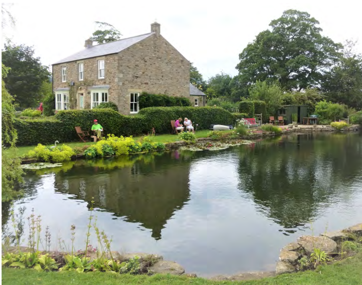
Lowbridge House lake.