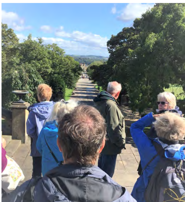
View from Greenhead Park's highest point at the War Memorial looking down the main avenue.