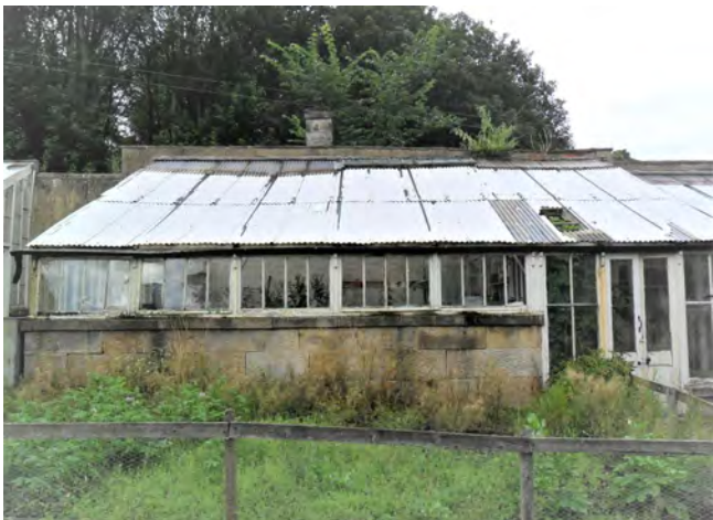
Potting shed, Weston Hall.

the Banqueting House are set at the back edge of the rich, alluvial flatlands straddling the River Wharfe, tucked against the steeply rising land to the north. This heavily wooded bank ensures that modern visitors are surprised as they drop down through the trees to discover the house, although historically the principal access was from Otley, east of the house. The embankment immediately behind the house advantageously faces south, providing a natural setting for gardens. The extant adjacent gardens on this sunny slope now include an inheritance of walled kitchen gardens – in various states of decline, including associated remnants of glasshouses.