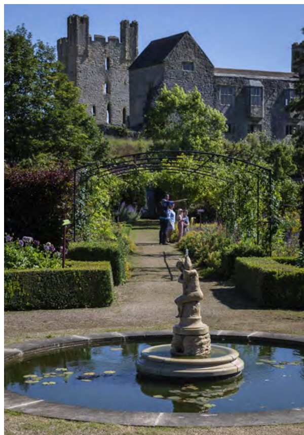
Dipping pond and Helmsley Castle.

It made us all determined to work even harder, both to ensure that the garden would not fail and to safeguard its future. With just two full-time staff and a part-time volunteer coordinator, the garden is primarily maintained by our 50 strong volunteer team who have been the driving force behind getting the garden back into shape after three months of furlough.