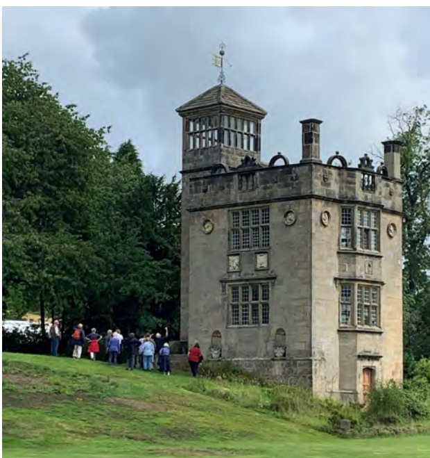
The Banqueting House, Weston Hall

In contrast, the polite views from the main house and the Banqueting House are towards the south and east, over lawns, falling meadows and down the valley. A substantial lake sits in the middle background – it has an island and it has previously enjoyed a bridge. A highlight is the late 16th/early 17th century Banqueting House, built as a place to eat dessert and enjoy the views from the roof, as was in vogue at the time of its construction.