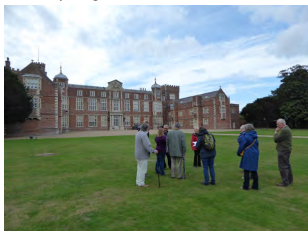
Burton Constable Hall Entrance Front with YGT Conservation members 2018

At the beginning of April we were consulted on the National Trust Proposals for the Café Building at Canal Gates, Studley Royal - Heritage Impact Scoping Report " Studley Revealed ": Proposed Renovation and Development at Canal Gates, Studley Royal . Together with the GT we wrote of our strong support for the NT's charitable purpose to provide physical and intellectual access to special places and the great conservation, repair and presentation work that has been done over many decades to sites owned and managed by the NT. However, we explained that we remain very concerned about the proposals for the Café Building at Canal Gates, Studley Royal and, although the HIA Scoping Report goes into considerable detail, it does not allay our concerns about the whole concept and the GT/YGT is unable to endorse these proposals. We have not heard anything further.