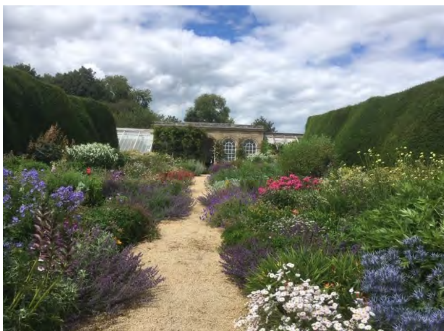
Norton Conyers in high Summer.