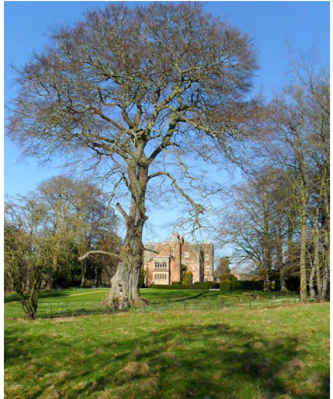
Kiplin Hall and landscape.