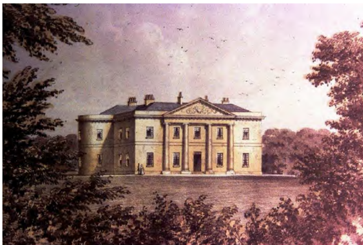
Clifton Castle: a 19th-century two-colour lithograph

Also available to personal callers at North Yorkshire County Record Office, tel: 01609 777585