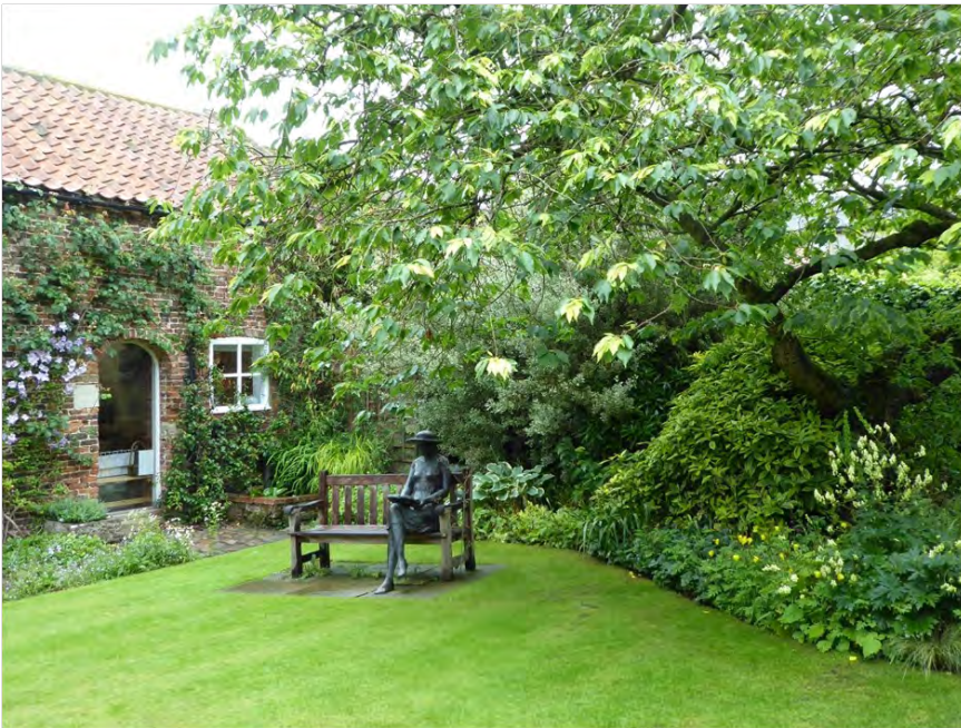
One of the beautiful cottage garden style 'rooms' at Stillingfleet Lodge Garden.