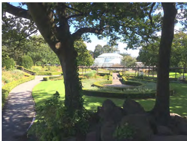
The restored Conservatory and Rose Garden