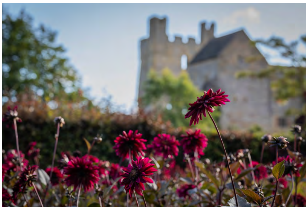
Dahlias and Helmsley Castle.