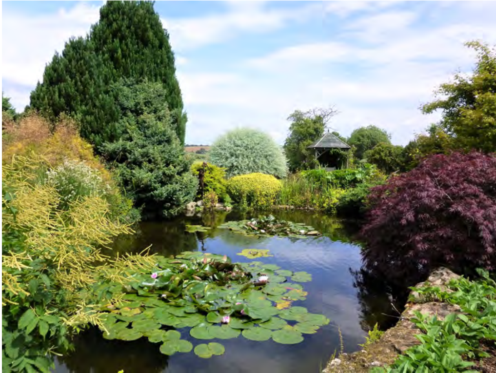
Broaches Farm pond.