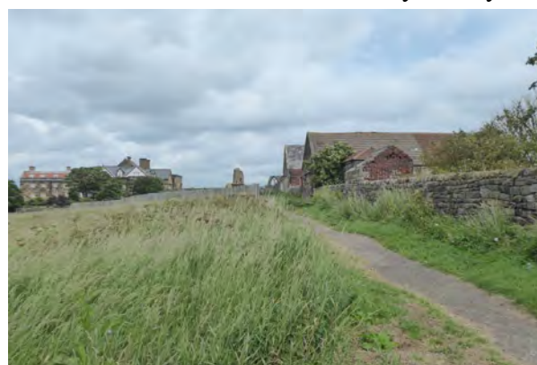
Barns for Whitby Gin Distillery with Abbey House and Gardens to left.

We have had our first planning application for a gin distillery: that would not have happened in the early years of YGT! So, like much else, YGT records the fashions of the times whether it is for horticulture, design, leisure or indeed imbibing alcohol – perhaps we should raise a glass. The planning application from the owners of Whitby Gin is for the alteration and extension of old agricultural buildings/barns on land south of Whitby Abbey. The buildings are listed and the site is within the Whitby Conservation Area, part of the Grade I Whitby Abbey House complex, close to the scheduled Whitby Abbey and the north barn lies within the Grade II Registered Historic Park and Garden of Whitby Abbey