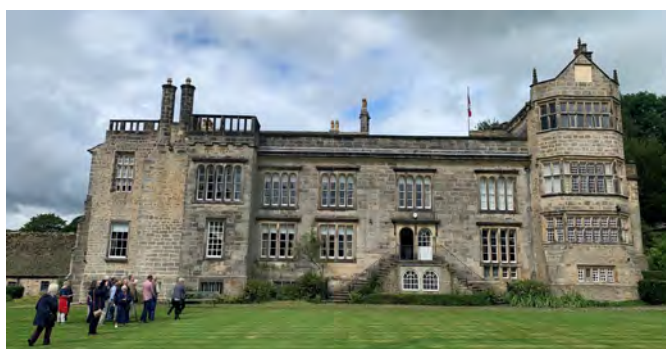
The East Principal Front, Weston Hall.

But we are the Yorkshire Gardens Trust so it was time to get out into the emerging sunshine. It is fair to say that the gardens at Weston are in need of some restoration and the current owners do have long-term plans to do so. Both the Hall and