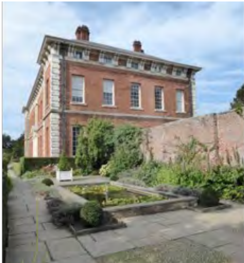
Beningbrough Hall.

and moved to the Castle Howard Estate (Grade I, first registered 1984). He effectively took the entire nursery stock and began to form it into a series of magnificent ornamental gardens. In the 1970's the Rose Garden at Castle Howard was completed, arranging a collection of old shrub roses (his favourite was the moss rose Chapeau de Napoléon ) into an elegant formal arrangement with his trademark hostas, lavender hedges, pergolas and arbour seats. Ray Wood was filled with flourishing rarities as a woodland garden, big specimens of Fitzroya cupressoides and many species of eucalyptus looming over great drifts of terrestrial orchids on an apparently unpromising north-facing slope. The new arboretum, of incredible extent, was mainly planted as tiny specimens in the (justified) hope that they would thrive better than larger trees planted as standards. At Beningbrough Hall 3 (Grade II, first registered 1984) small formal gardens enclosed by low walls and clipped hedges were laid out in existing enclosures flanking the south front in 1977.