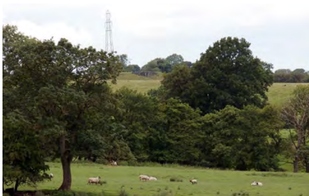
High Royds Reservoir

The West Riding Pauper Lunatic Asylum, Menston was built on 300 acres of agricultural land formerly owned by the Fawkes family of