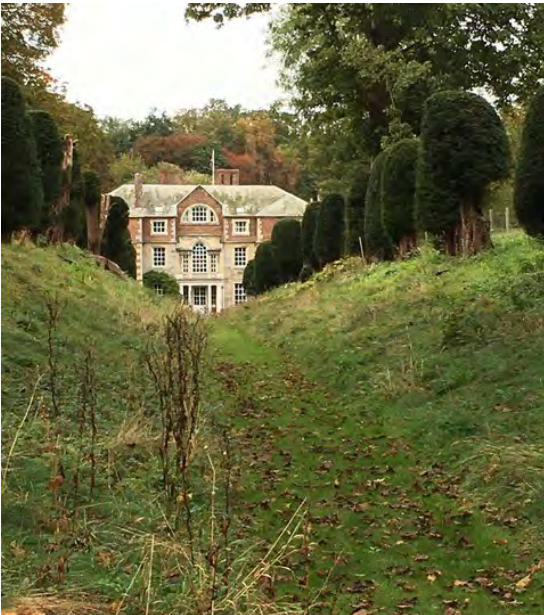
Boynton Hall.