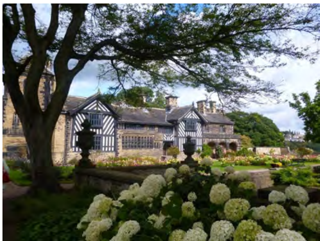
Shibden Hall.