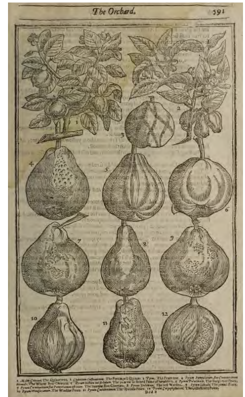
Pears from Parkinson's Paradisi in sole