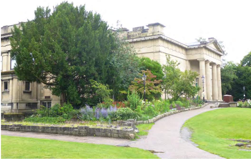
The Yorkshire Museum, with colourful, recently replanted herbaceous border