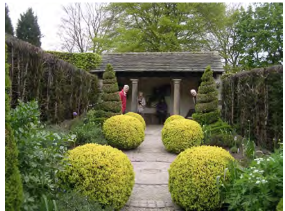
York Gate Garden.