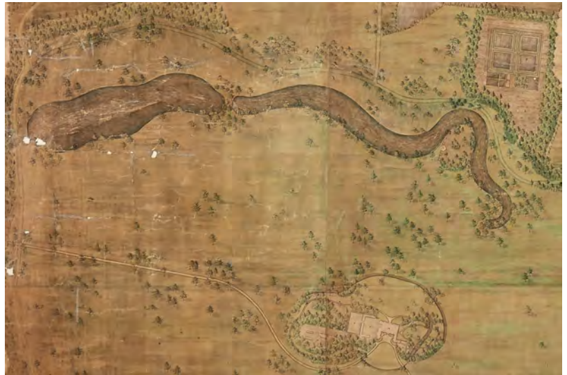
Detail from the Plan of Improvements for Burton Constable by Thomas White, 1768.