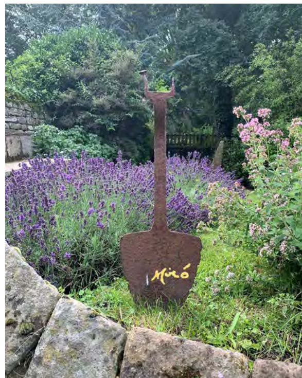
The Stone Garden, Weston.

Wandering up the hill we encountered a very different kind of garden: the hortus conclusus that is Ronnie Duncan’s stone garden. For over 25 years Ronnie has been creating this garden from stone, mostly reclaimed or repurposed, but with the occasional piece sculpted for the site. As a sign at the entrance warns, “this is not a horticultural garden” and a quotation from Ian Hamilton Finlay, the artist-creator of Little Sparta in Scotland, wittily reinforces the point: “Flowers in a garden are an acceptable eccentricity”. But the garden doesn’t lack colour and simple planting, including lots of lavender and alchemilla mollis perfectly accentuates the greys, greens and mauves of the local stone.