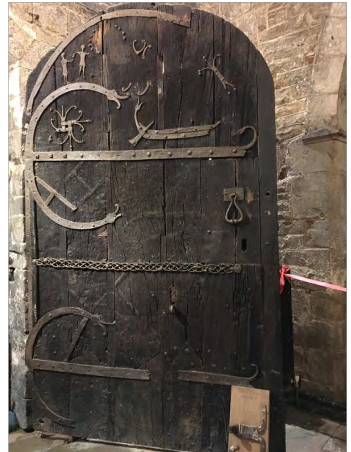
The 12th century, historically important south door of St Helen's Church, Stillingfleet.