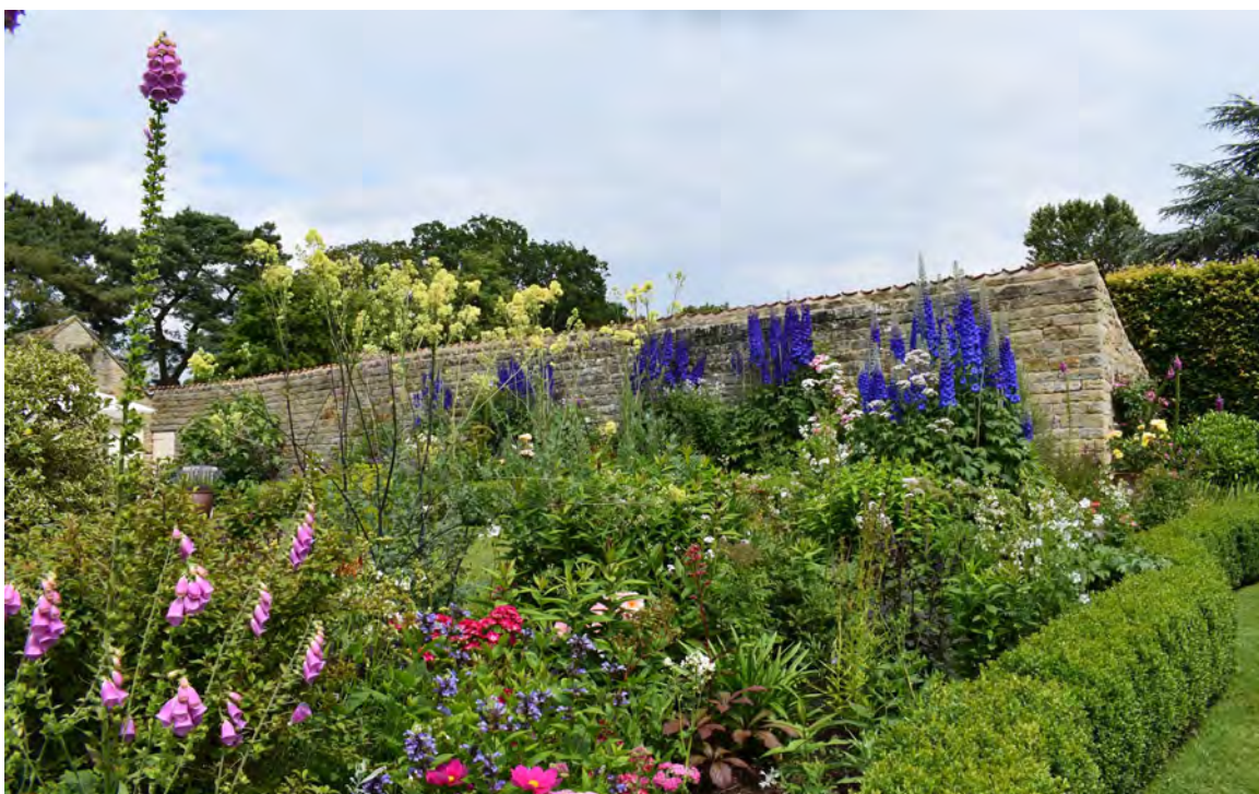
Penelope's remarkable 12' delphiniums against the limestone wall.

Returning to the garden, certain beds are bordered with clipped box giving a hint of formality.