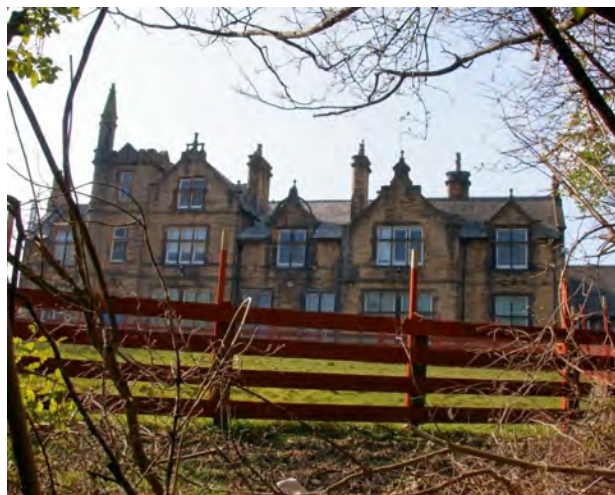
Joseph Nutter Orphanage/House