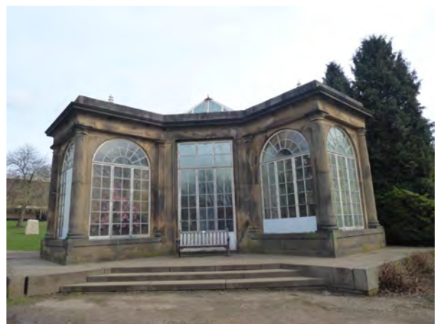
Bretton Hall Camellia House 2020